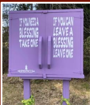
photos from the beginning of the Blessing Box