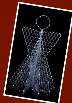
right: the new Crab Pot Angel