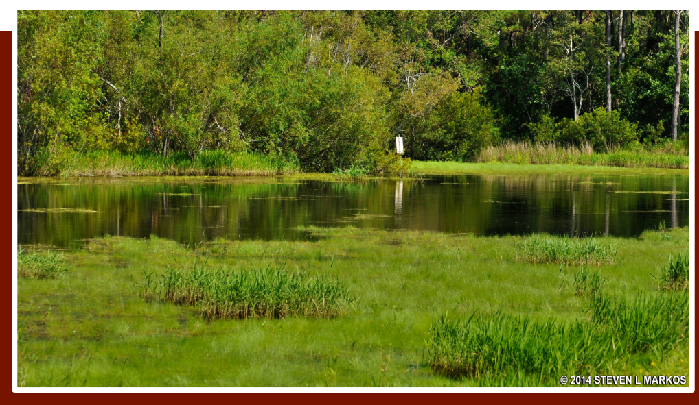
Willow Pond

This natural, freshwater pond allows the museum's interpretive programming to include the complete story from live ducks to decoys and the importance of providing clean and safe areas for our wildlife. Our educational programs taking place around the Willow Pond focus on building a broader understanding and appreciation for our natural coastal environment.