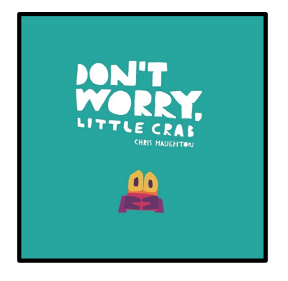
Don't Worry, Little Crab By Chris Haughton

Little Crab and Very Big Crab live in a tiny pool near the sea. Today they're going for a dip in the big ocean. Then comes the waves. WHOOSH! Maybe it's better if they don't go in? With vivid colors, bold shapes, and his trademark visual humor, Chris Haughton shows that sometimes a gentle "don't worry, I'm here!" can keep tentative little crabs sidestepping ahead — and help them discover the brilliant world that awaits when they take the plunge.