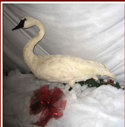
The Great Swan out of the marshes of Core Sound stands sentinel over The Davis Shore Community Christmas at Davis Original Free Will Baptist Church, December 11, 2009