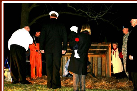
The Nativity at Davis Shore Community Christmas, December 12, 2009 " Bearing Gifts, We Travel A Far ..." the Veteran, the Fisherman, the Sailor, the Mom with her Sailor Boy, the Little Drummer Boy, the Soldier, & the Businessman

We think the Great Swan will continue to stand his sentinel at Davis Shore until TWELFTH NIGHT EVE when on midnight January 5, 2010, the Great Swan can see if the cattle, in their stalls, kneel down right at midnight as it is said they did that night long ago in Bethlehem.