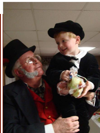
"God Bless us everyone"