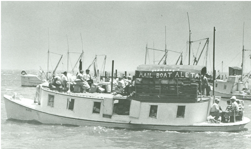
The Mailboat Aleta